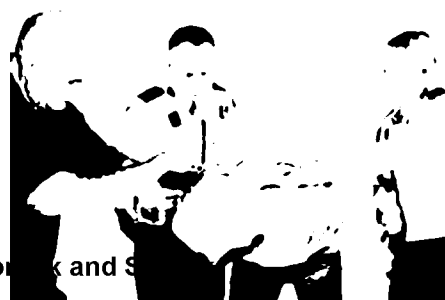
There is only one type of Spit Guard available in Norfolk and Suffolk