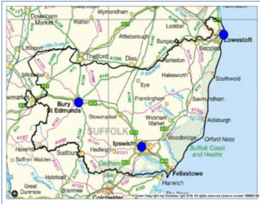
Figure 1 – Map of the County of Suffolk

Note: Principal police stations are marked in blue